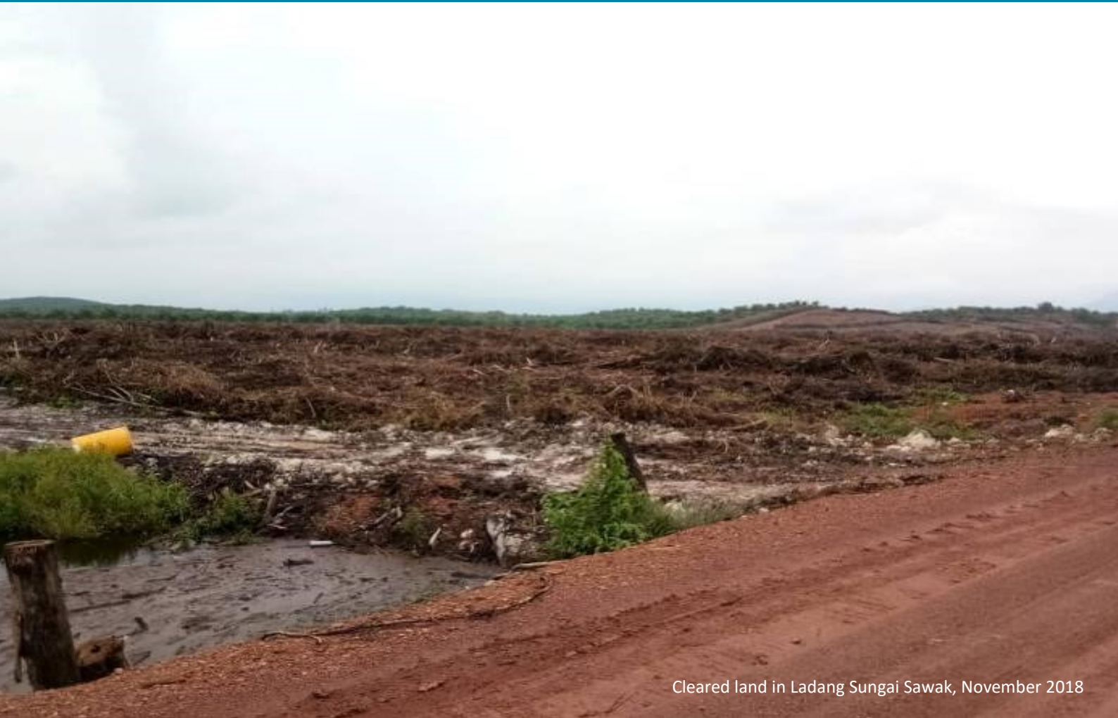
Cleared land in Ladang Sungai Sawak, November 2018