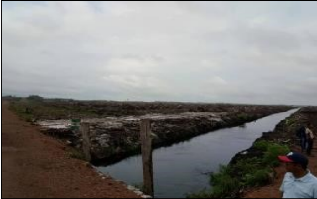
Photos taken at coordinate N2°46.928' E103°21.898' show a cleared swamp habitat. The area will be planted with oil palm after the monsoon season finishes.